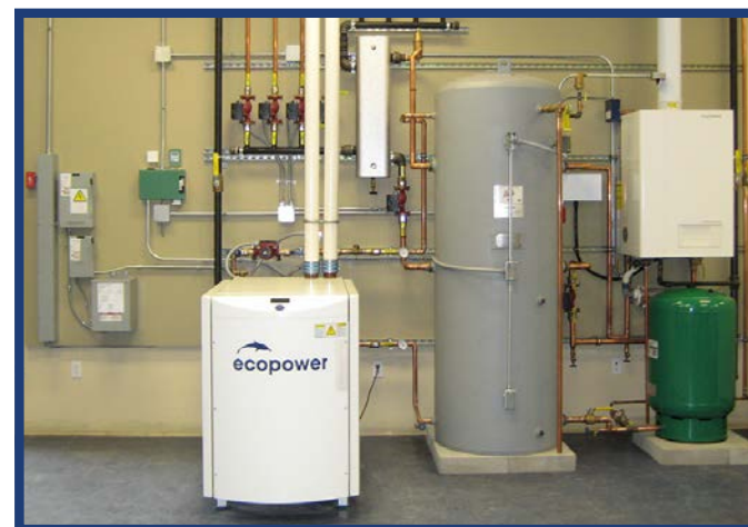
Example of a typical home installation.

The ecopower® system runs completely counter to a standard boiler or forced air furnace concept. In those applications, a thermostat typically turns on and tells the heat source (boiler, furnace) to energize and run at full speed to supply heat to get to the fixed set point. When that point is achieved, the unit turns off and awaits the next command. With the ecopower®, it anticipates the heat demand from sensors located in the house, the buffer tank, and outside, and varies it's output to satisfy that demand. During this modulation, the ecopower® runs at a level that will maintain a constant heat value to support the heat requirement and keep the engine running and generating electricity.