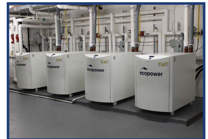
Example of parallel operation.